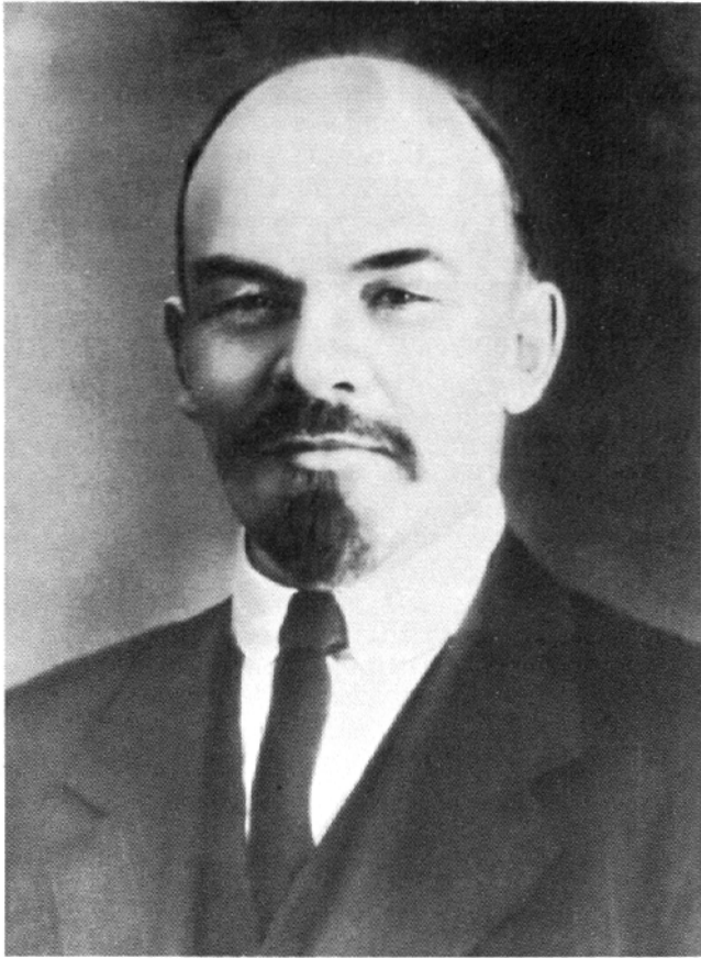
V. I. LENIN 1917